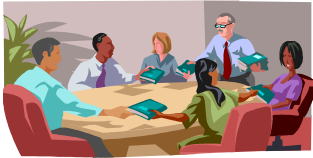
Training opportunities available to all IHSS consumers.

“Learn more about the IHSS System and getting the right care for your situation.”