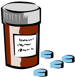
Sign up for your discount drug card.

For further information contact the HICAP Program at Council on Aging Silicon Valley (408) 296-8290 or go to www.medicare.gov