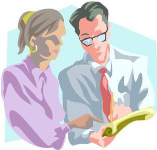
Training opportunities available to all IHSS consumers.

“A good working relationship between the consumer and provider makes a huge difference in the quality of the experience.”