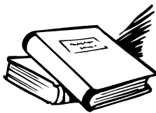
Videos and handbooks are available at no cost.